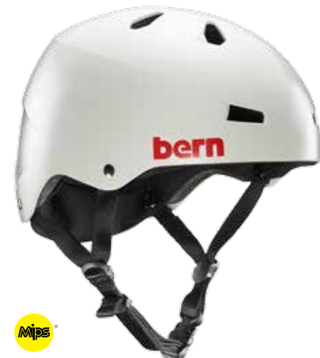
Satin Light Grey