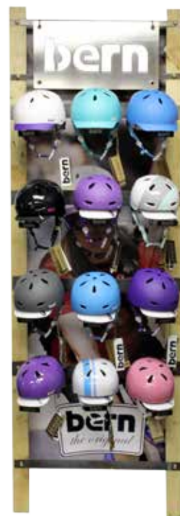
3 LID BOW Can hold 12 units 29" Wide X 82" Tall 73.5cm Wide X 208cm Tall