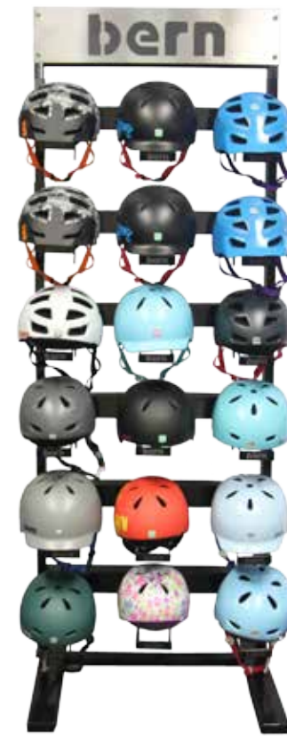
36 UNIT HELMET DISPLAY 18 UNITS PER SIDE 26" Wide X 73" Tall X 36" Deep 66cm Wide X 186cm Tall X 91.4cm Deep