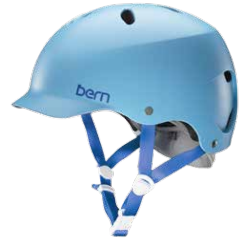
Satin Light Blue