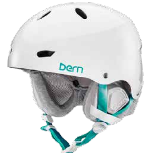
Women's Winter Liner