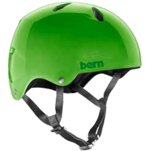
Translucent Neon Green