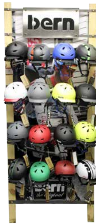
4 LID BOW Can hold 16 units 34" Wide X 82" Tall 86.5cm Wide X 208cm Tall