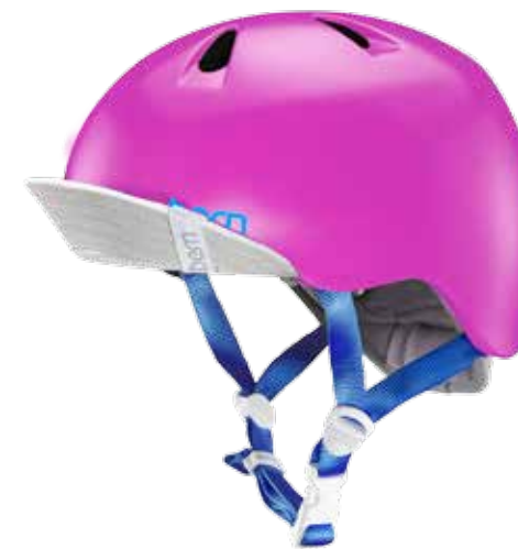
Satin Hot Pink