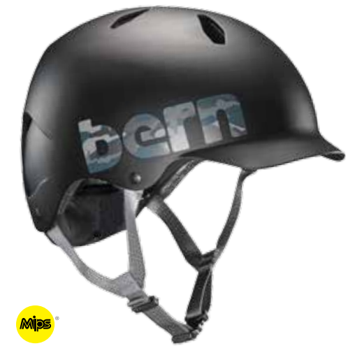
Matte Black Camo Logo