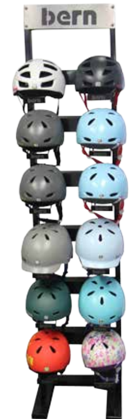
24 UNIT HELMET DISPLAY 12 UNITS PER SIDE 15.75" Wide X 73" Tall X 27.5" Deep 40cm Wide X 186cm Tall X 70cm Deep