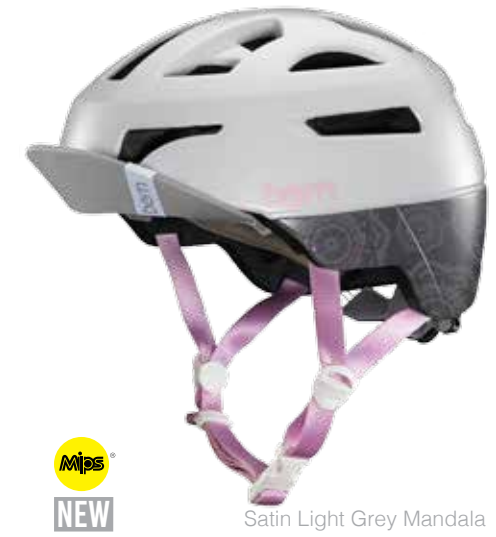
Satin Light Grey Mandala