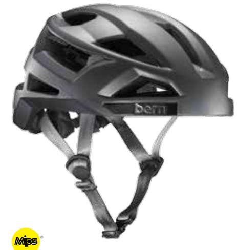
Satin Dark Silver