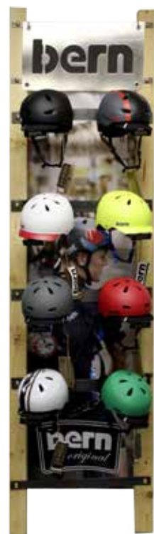
2 LID BOW Can hold 8 units 24" Wide X 82" Tall 61cm Wide X 208cm Tall