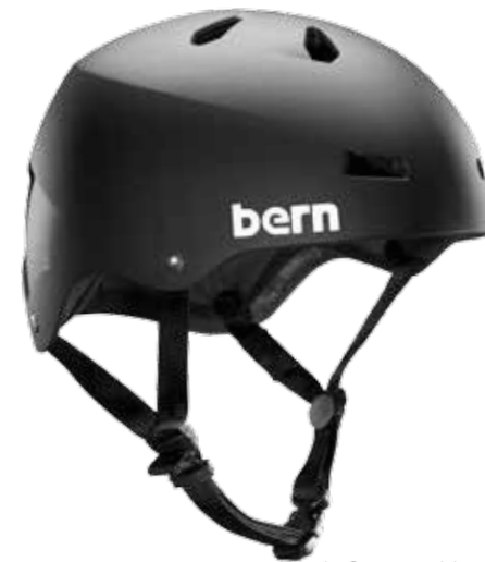
Men's Summer Liner

The Asteroid and Meteoroid fit all new and older Bern helmets with a two-hole mount located in the rear of the shell