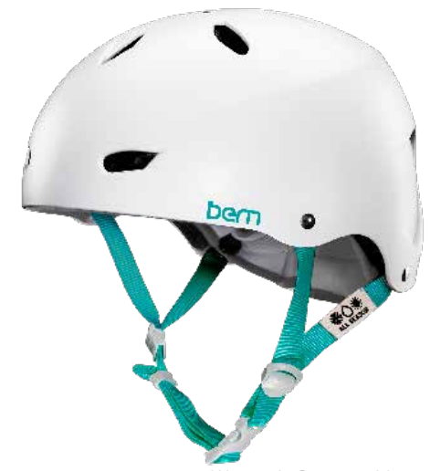
Women's Summer Liner