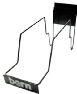
SLAT WALL HANGER