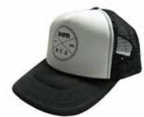
BERN SNAPBACK HATS