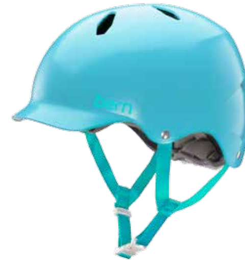
Satin Light Blue