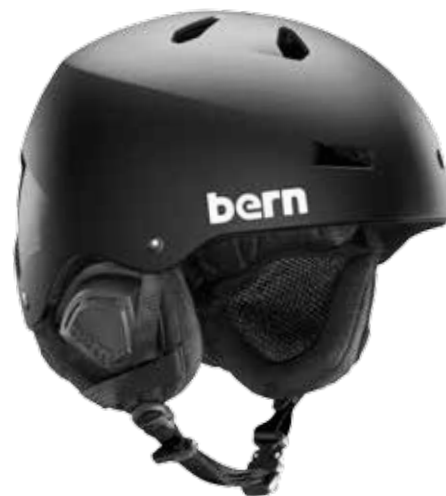
Men's Winter Liner