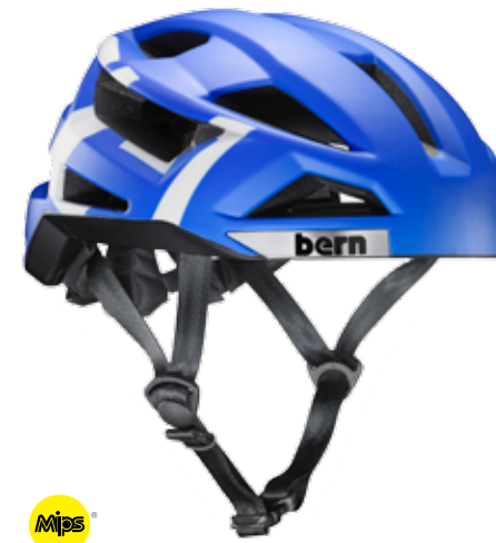
Matte Royal Blue Type