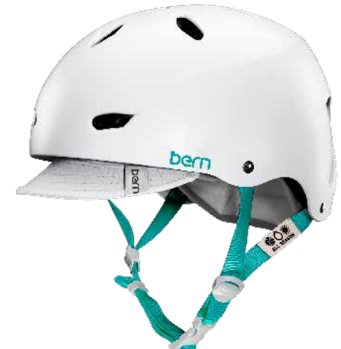
Women's Summer Visor