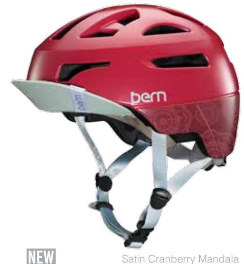
Satin Cranberry Mandala