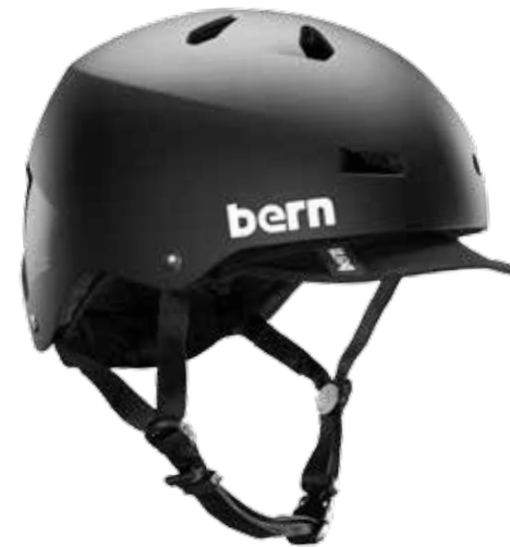
Men's Summer Visor