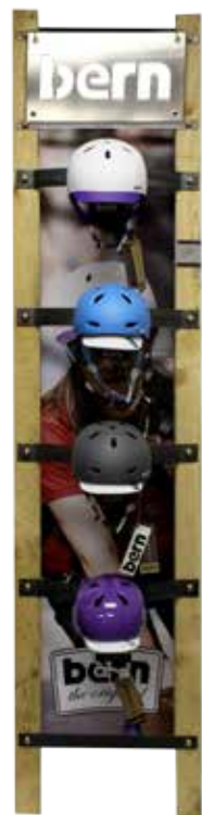
1 LID BOW Can hold 4 units 19" Wide X 82" Tall 48cm Wide X 208cm Tall