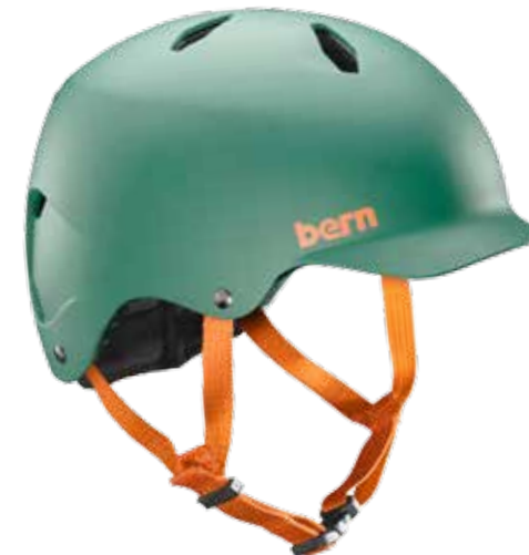
Matte Hunter Green