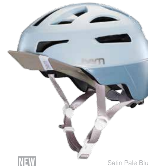
Satin Pale Blue